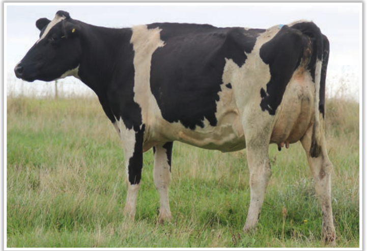
Warramont Solomon Fetta, VG.