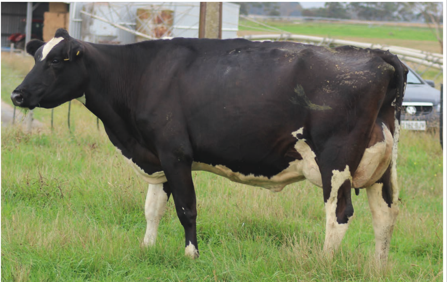
Warramont Microchip Desktop, VG86.