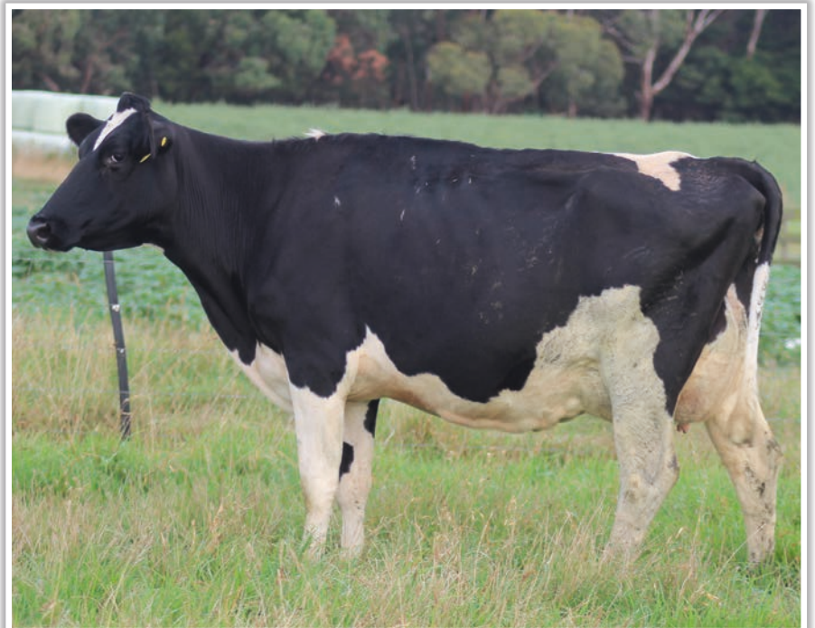
Warramont Crush Martini, VG. Family member.