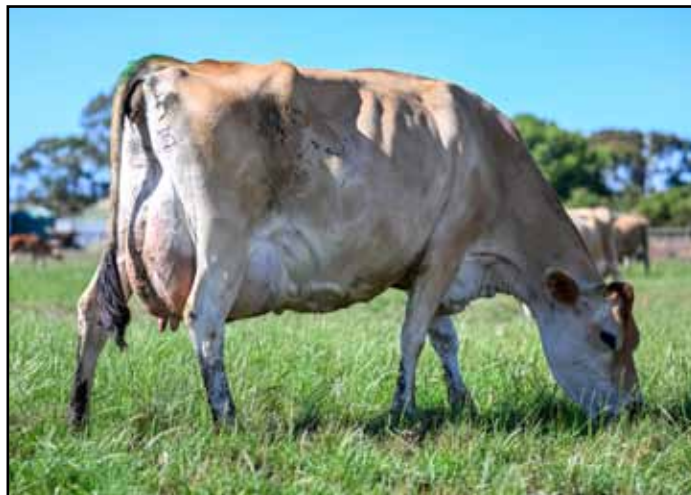
ELMS PARK STARLIGHT 253, EX - Sister to 2nd Dam of Lot 54