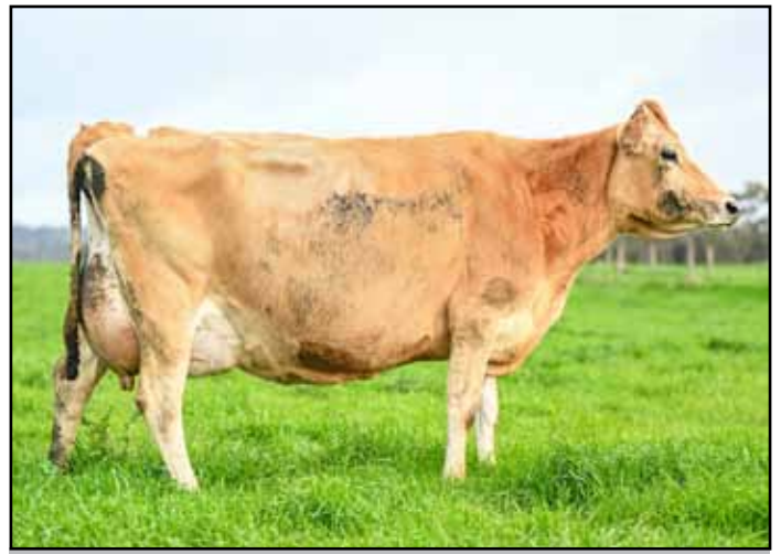
CAMO LASSIE 269, EX90 - Family Member