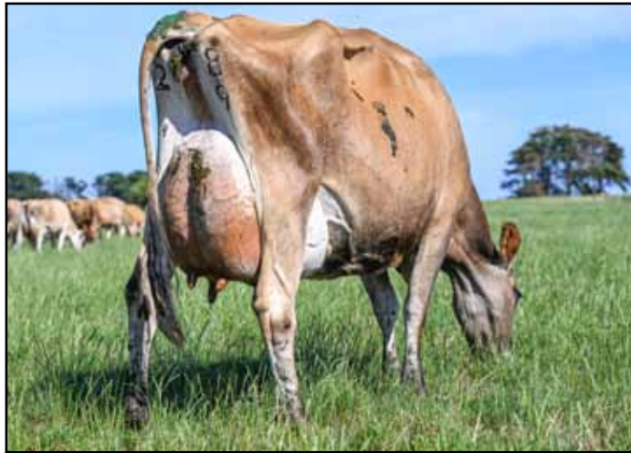
ELMS PARK FAITH 289, EX92 - Sister to 2nd Dam of Lot 53