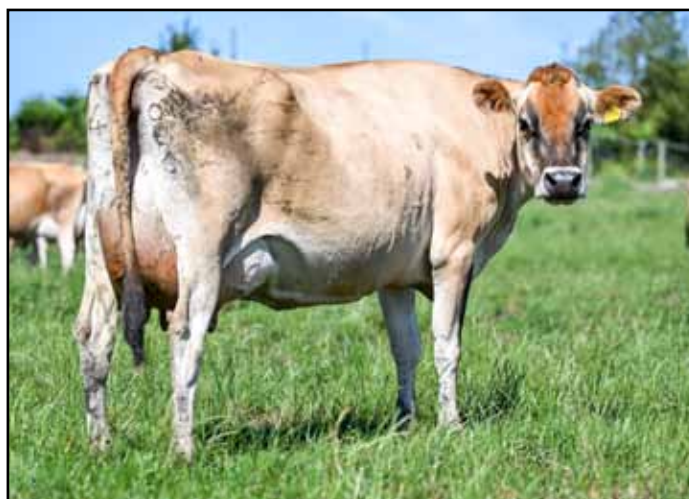
ELMS PARK APRIL 498, EX90 - Sister to Dam of Lot 66