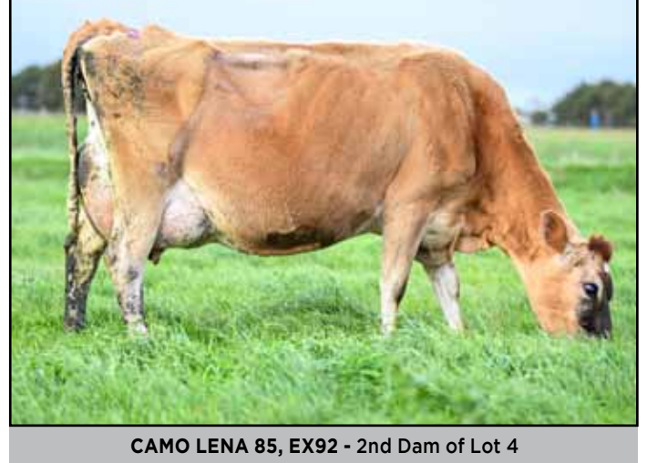
CAMO LENA 85, EX92 - 2nd Dam of Lot 4