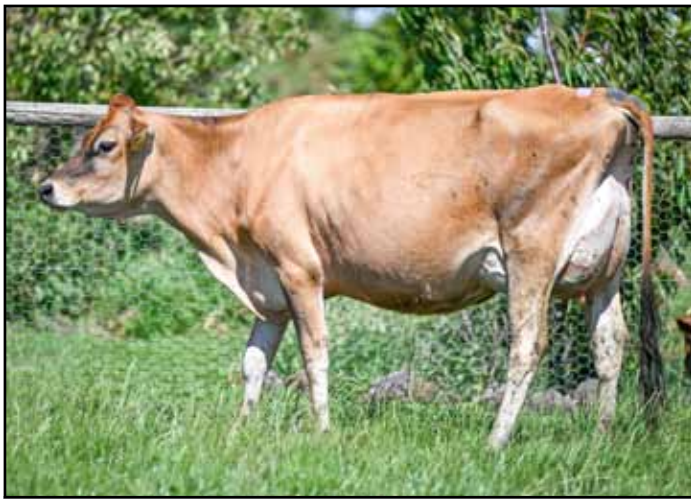
ELMS PARK DRUSILLA 620, EX - Family Member of Lot 57