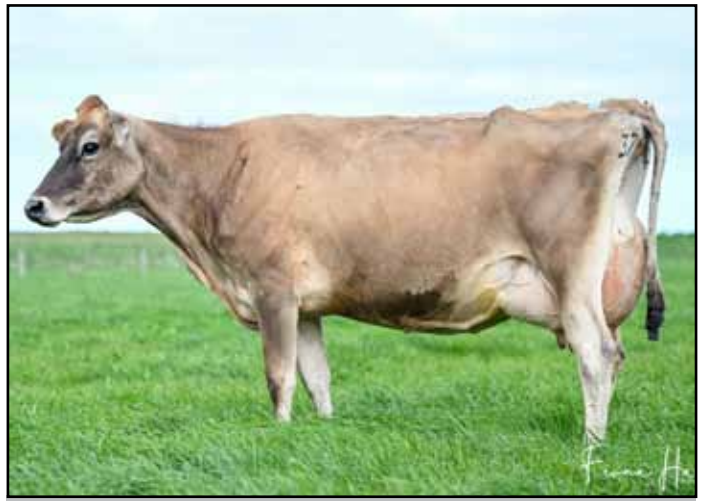
CAMO ANGE 14, EX - Sister to Dam of Lot 36