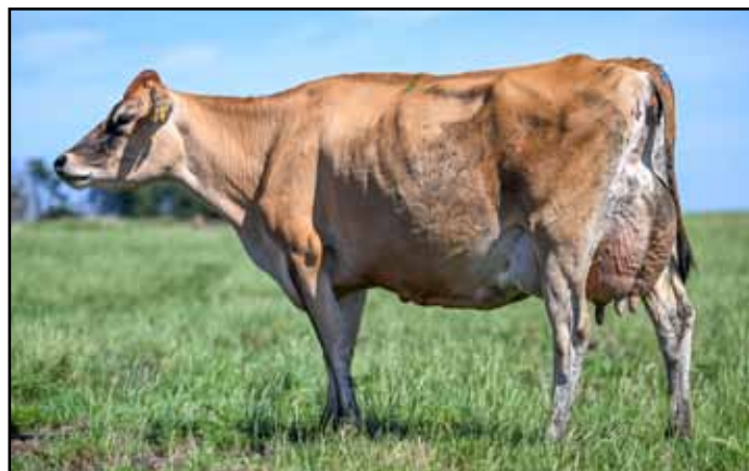
ELMS PARK FAITH 417, EX91 - Family Member of Lot 51