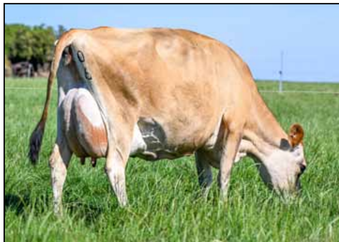
ELMS PARK GRAN 406, EX90 - Family Member of Lot 65

Elms Park Kamakazi Gran 784 Intermediate Champion Camperdown 2025