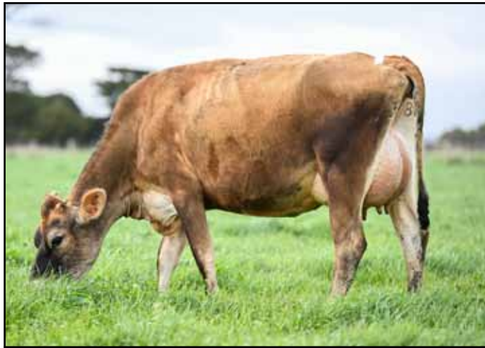
CAMO LASSIE 318 - Sister to Dam of Lot 17