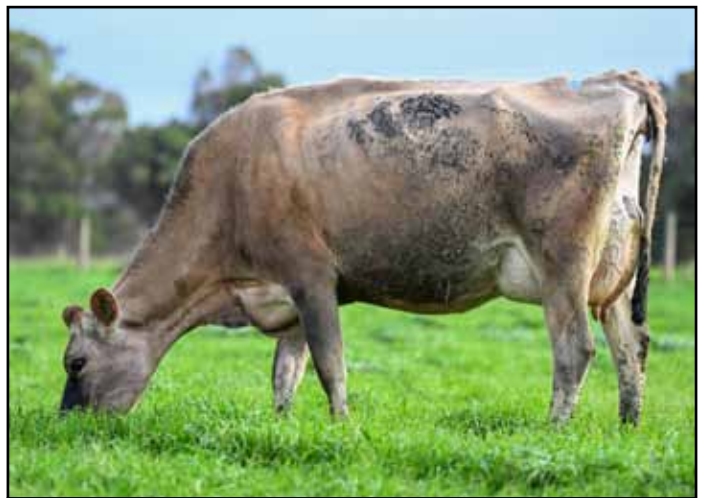
CAMO ANGE 18, VG87 - Family Member of Lot 37