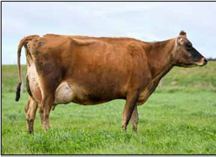
CAMO KAY 5, EX90 - Dam of Lot 23