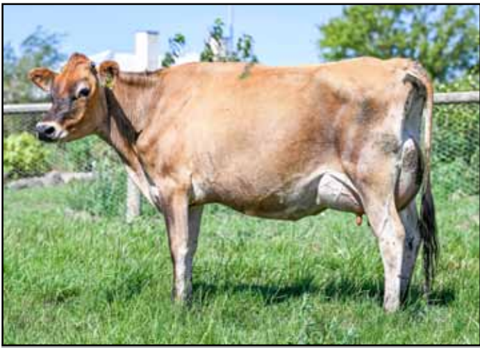
ELMS PARK DRUSILLA 616 - Family Member of Lot 58