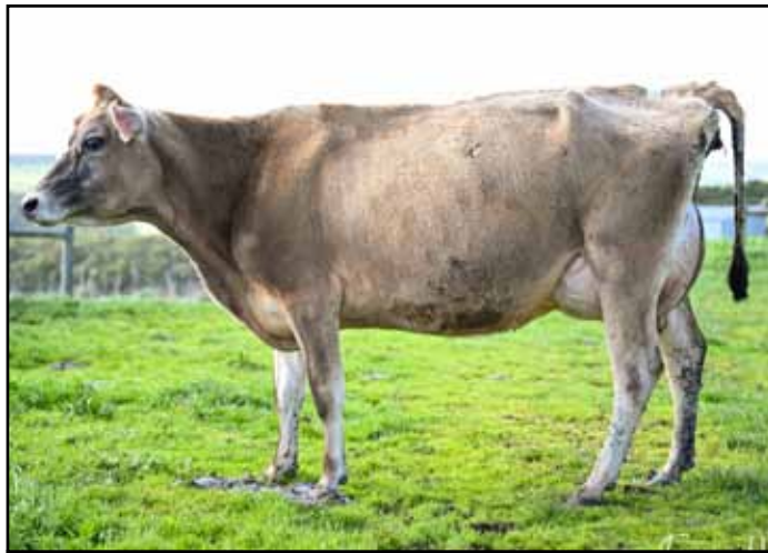
CAMO CINDY 14, VG88 - Family Member to Lot 34