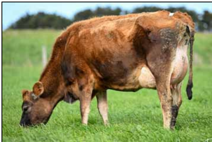
CAMO LADY 62 - Family Member of Lot 29