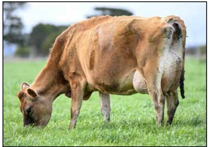
CAMO ELSIE 4, VG88 - Maternal sister to Lot 44