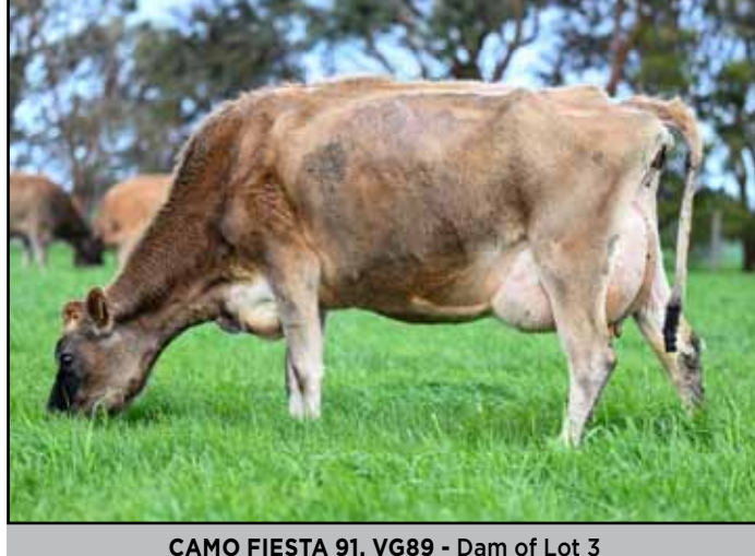
CAMO FIESTA 91, VG89 - Dam of Lot 3