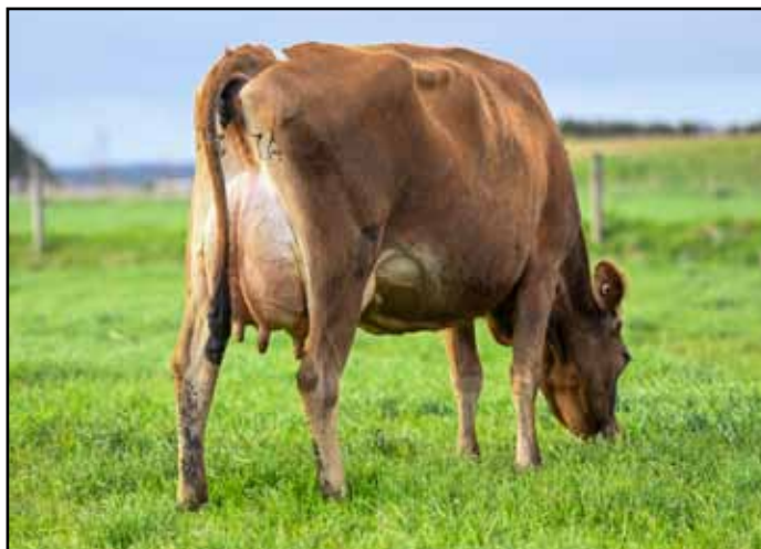
CAMO LADY 53, VG89 - Dam of Lot 31