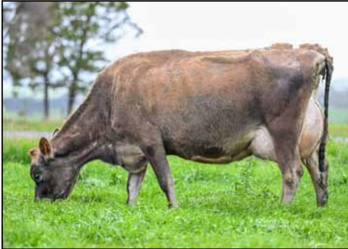
CAMO LASSIE 286, VG88 - Family Member