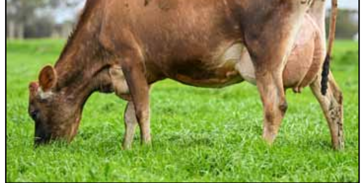
CAMO FAIRY 36, VG88 - Family Member of Lot 26