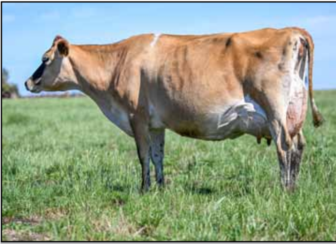
ELMS PARK ELISE 432, EX90 - Family Member of Lot 68