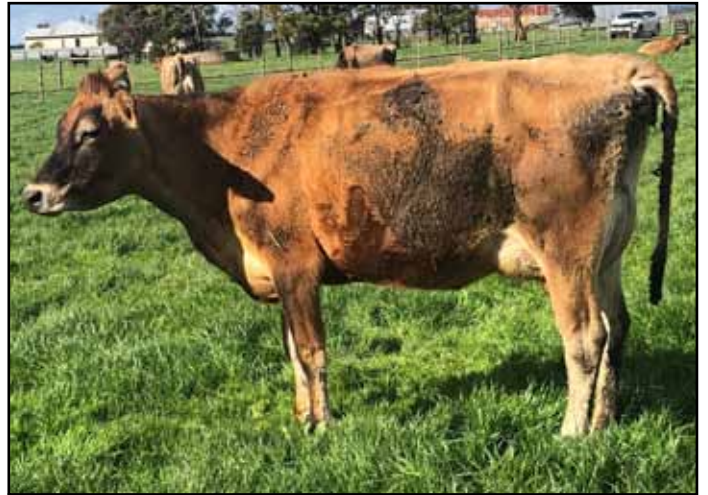
CAMO LASSIE 320 - Sister to Lot 15